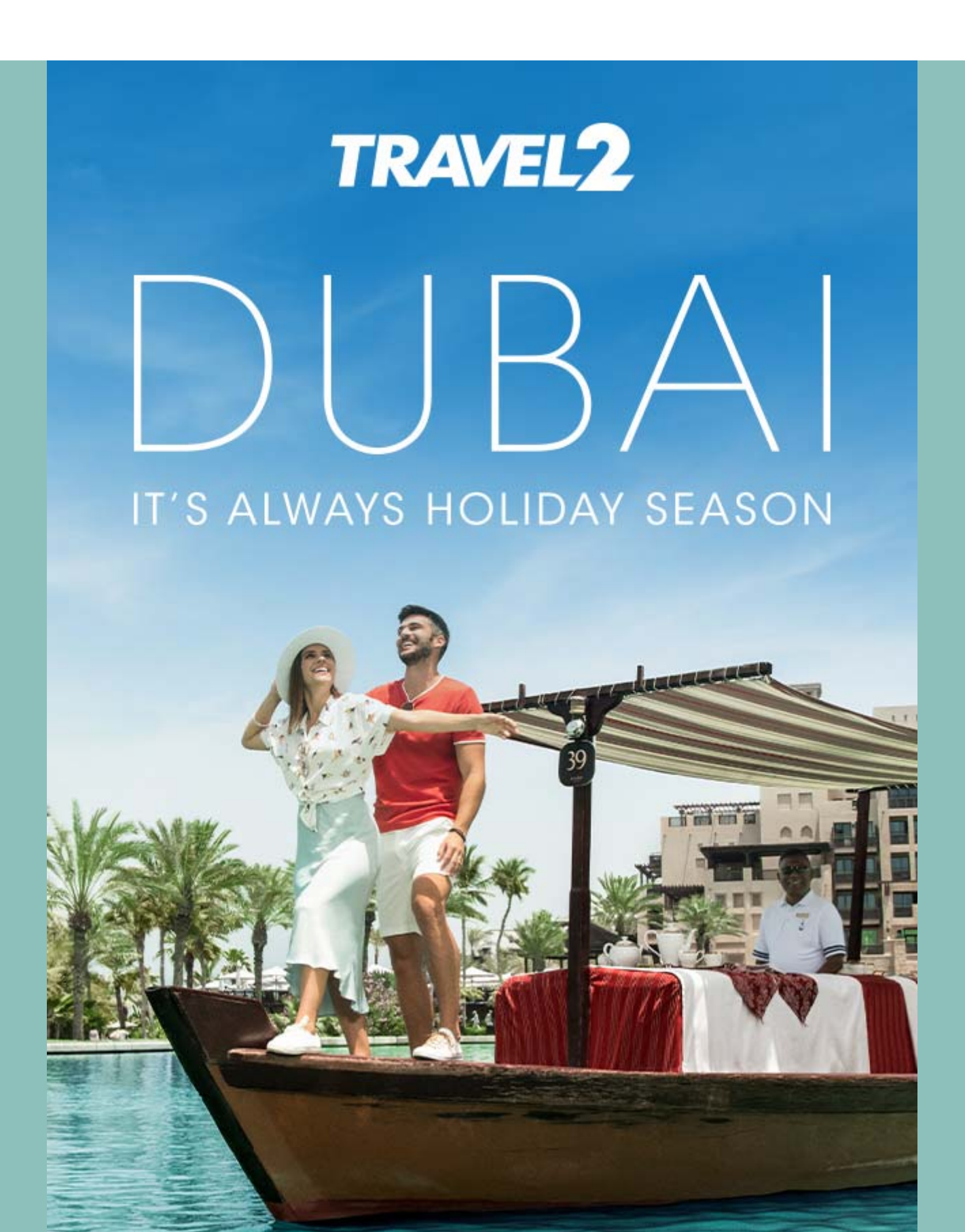
It's always holiday season

Lying in the calm, blue waters of the southern Gulf and flanked by a majestic desert, the iconic city of Dubai is a place of fascinating contrast which offers year-round sunshine and 5-star luxury. Check in to one of the many sumptuous five star spa hotels and prepare to be pampered with the